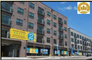
2 E. Wells Street

C H E S A P E A K E R E A L T Y P A R T N E R S