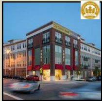
1901 S. Charles Street