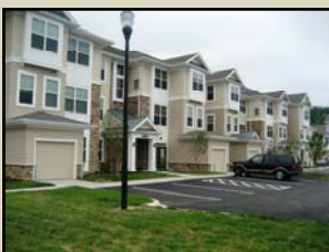
The Reserve at Riverside